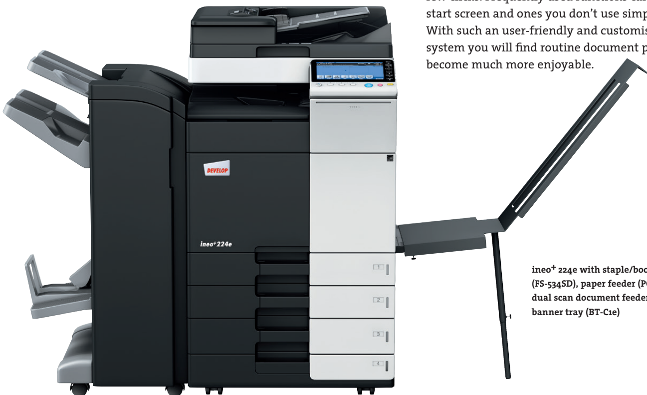
ineo+ 224e with staple/booklet finisher (FS-534SD), paper feeder (PC-210), dual scan document feeder (DF-701), banner tray (BT-C1e)

Many multifunctional office systems are anything but user-friendly. The ineo+ 224e, in contrast, is simplicity itself. An intuitive, easily understandable operating concept ensures that it is as easy to use as your smartphone or tablet. The 9-inch capacitive touchscreen comes with familiar multi-touch operations such as flick, drag&drop and pinch in&out – so you will feel at home in this system in no time at all. Thanks to a new menu navigation structure you can see all functions in one go and select the settings you want with just a few clicks. Frequently used functions can be left on the start screen and ones you don't use simply removed. With such a user-friendly and customisable office system you will find routine document production jobs become much more enjoyable.