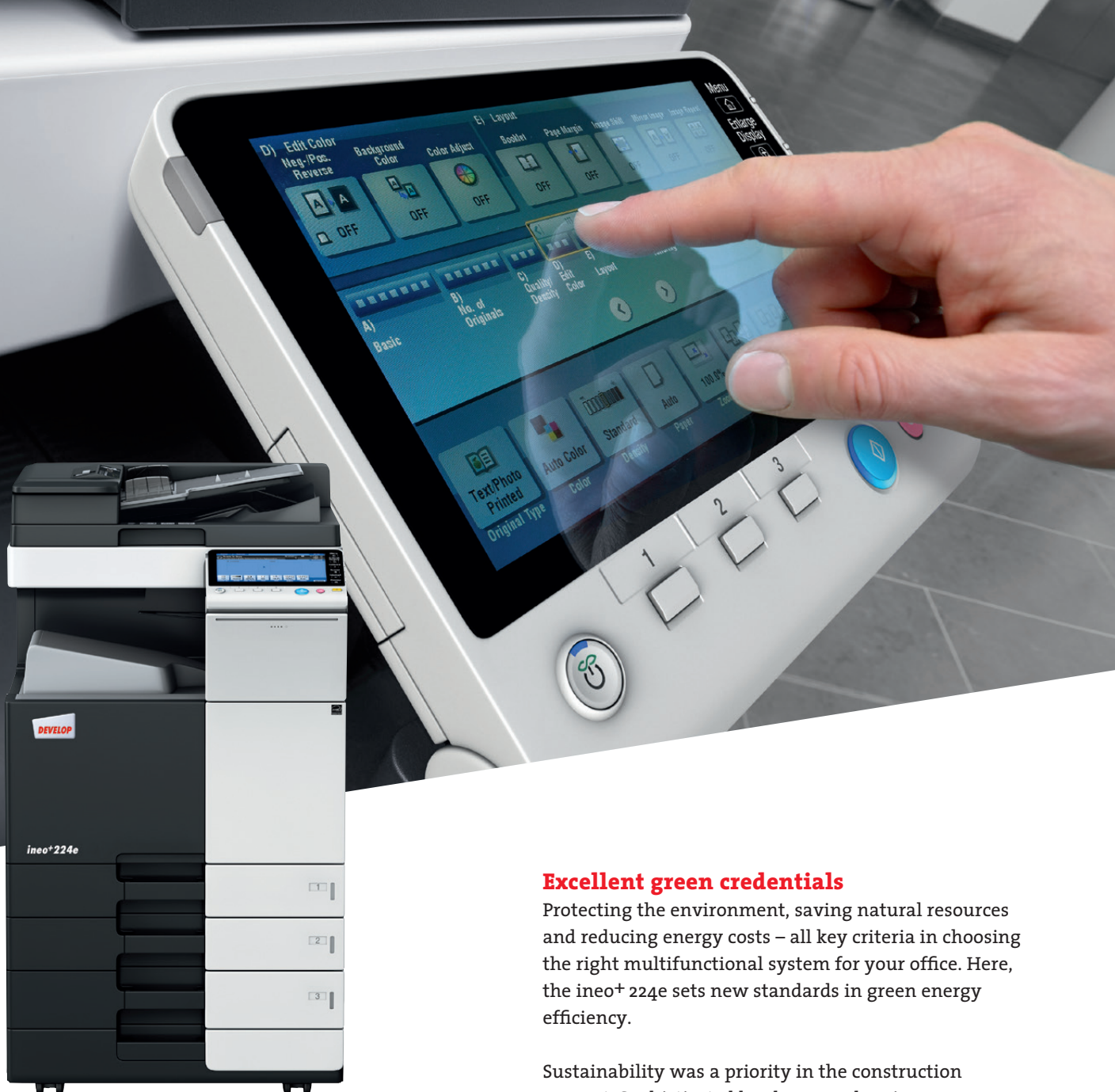
ineo+ 224e with paper feeder (PC-210) and dual scan document feeder (DF-701)